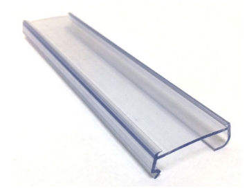
Shelf Label holders