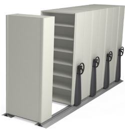
Single bay Mekdrive 3 Compactus ®

*With a standard ramp. If using the long ramp add 75mm (total of 236mm).