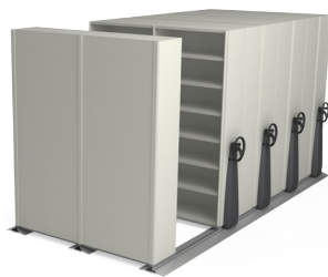
Two bay Mekdrive 3 Compactus ®