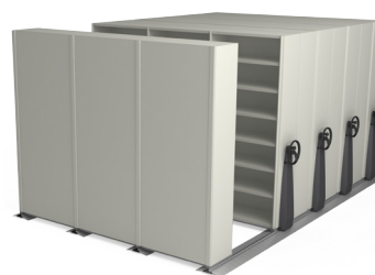
Three bay Mekdrive 3 Compactus ®