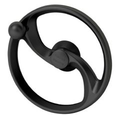
Mekdrive 3 hand-wheel